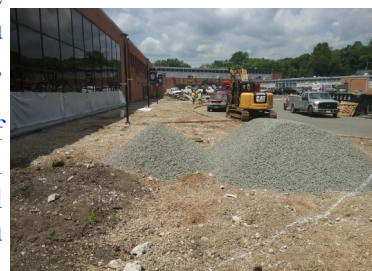
Exterior "Circle" at CHS/LAF