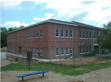
Exterior of MAS Addition

Our ongoing construction projects approved in the 2016 referendum will continue throughout the summer, with some work impossible to complete while students are present taking place now or in the coming weeks. In addition, there are other construction projects—such as a bathroom renovation at SBS and paving work at SBS and LAF—that will likewise cause inconveniences in and around the schools. Please be mindful that if you need to access a school this summer, there may be construction taking place. Left and Right are photos of some of the projects as of June 26, 2018. I will provide a full report on the status of all projects in August, as we welcome you back for another year.