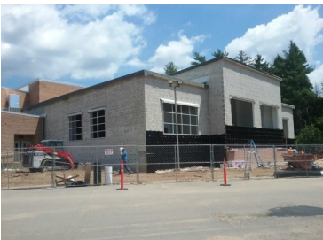
Exterior of CMS STEM Addition

Thank you again for a terrific 2017/2018 school year. I wish you a restful and restorative summer with your family.