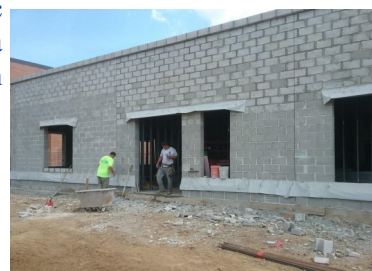
Office Addition behind CHS